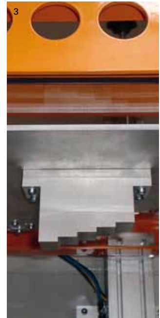
1 Y.MU231 cabinet 2 Finished wheel 3 Calibration step wedge