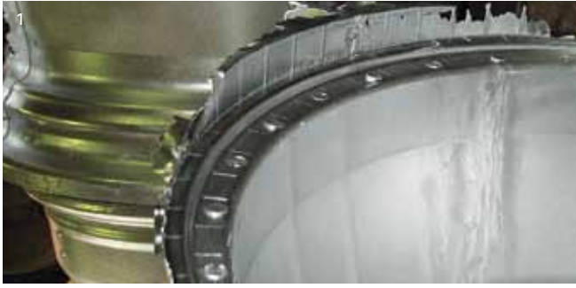
1 As-cast wheels 2 Y.MU231 operating console