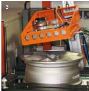
1 X-ray image of the hub 2 X-ray tube 3 Wheel and detector